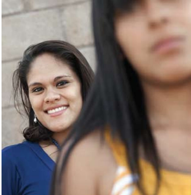
An AJS psychologist (background, in focus) with a rape survivor she has counseled.

of evil are empowered to do what they want with impunity. What happens is that you get a situation like the one in Honduras where as more people flock to church things get more violent in the streets every day.